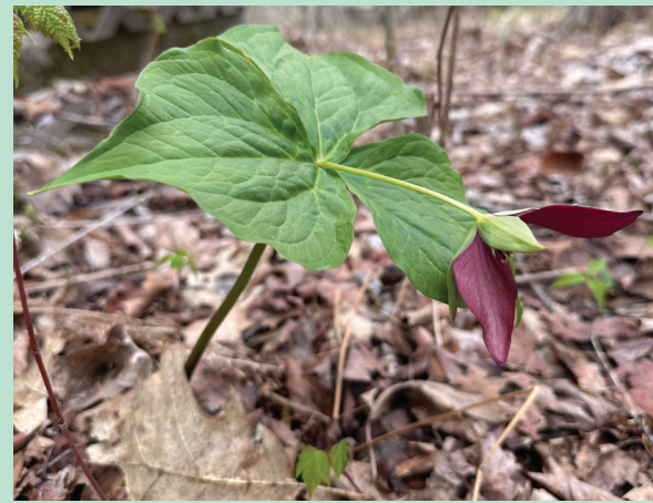
Spring Trillium (Lin Brown)

We'll be throwing a birthday party to celebrate this fall and we hope you can make it. We don't have a date set yet, but you can be sure that we'll let you know as soon as we do. You can follow us on Facebook and Instagram to stay in the loop.