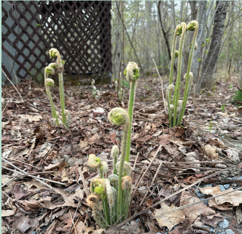
Fiddleheads

Welcome to the inaugural edition of Post Ponderings, and thanks for being a subscriber! Whether you're a Loch Lyme Legacy or planning your first visit, we made this newsletter with you in mind. Each issue, we will aim to delight you with a blend of stories from yesteryear, updates and current events, local recommendations, and more.