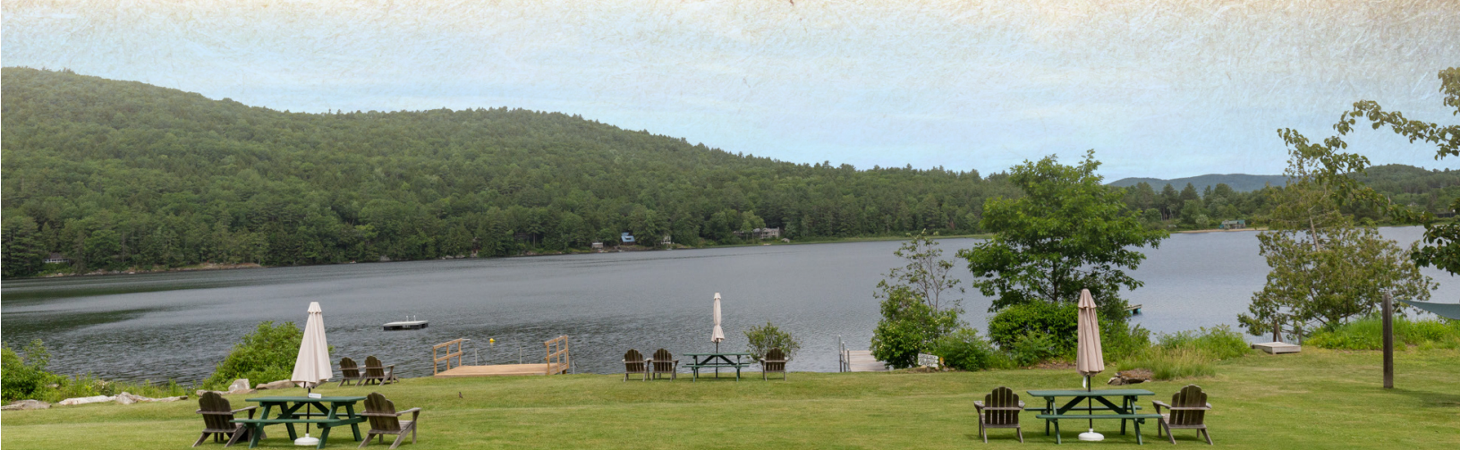
Our beloved waterfront is waiting for you!