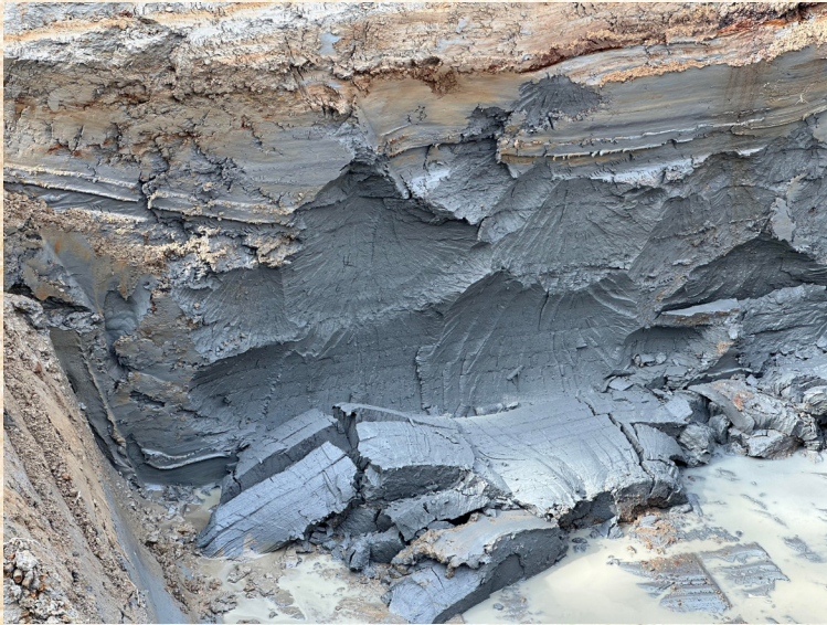
Scientists count varve layers to establish absolute ages for geological events, much like counting tree rings. Zoom in and you'll see these ones are about three inches thick.

While digging between Lakeside and Lakefield for our ongoing infrastructure upgrades, we uncovered glacial varves - beautiful layers of pure clay deposited at the bottom of the lake thousands of years ago.