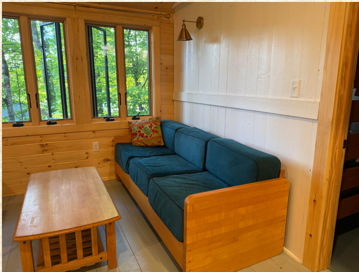
Iron and Bass' new living room is a perfect place to sip your morning coffee and listen to the birds. It's still available for Labor Day, but now that the secret is out, it won't be for long!

The offseason always brings improvements to Loch Lyme Lodge, and you may know we've been hard at work upgrading our infrastructure so we can stay open through the fall foliage - one of our favorite times of year!